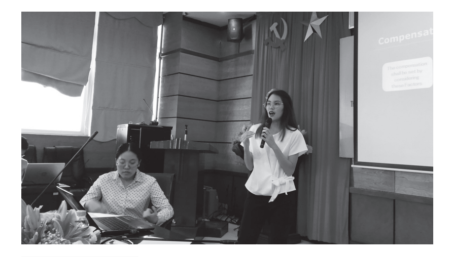
The presentation by Thai students

and Japan<sup>6</sup>. The socialist countries of Vietnam and Laos do not recognize private land ownership, yet have granted compensation rules for land use rights under existing Land Law<sup>7</sup>.